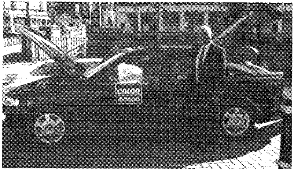
Alternative fuels, this gas powered family saloon was on display at the Green Transport event held in September

Pure juice - concentrated fruit juice - frozen, shipped, diluted,