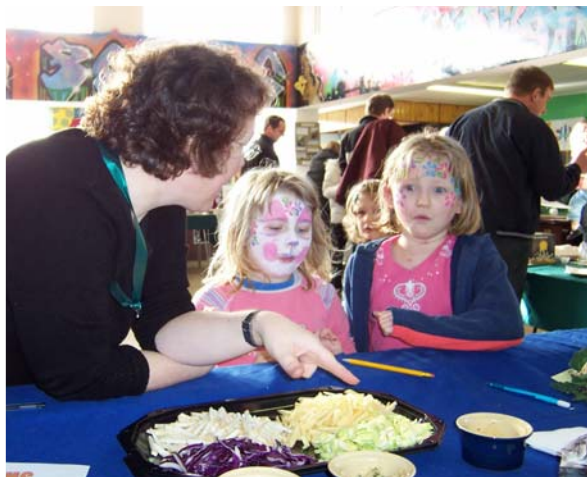
Youngsters taking part in the Veg Taste Challenge