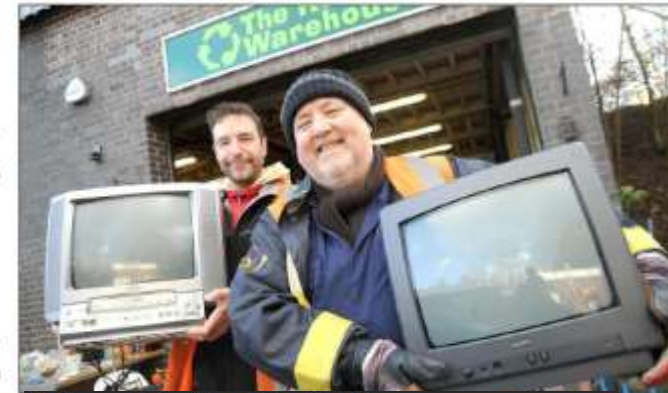
The Observer Series, Thursday May 27, 2010